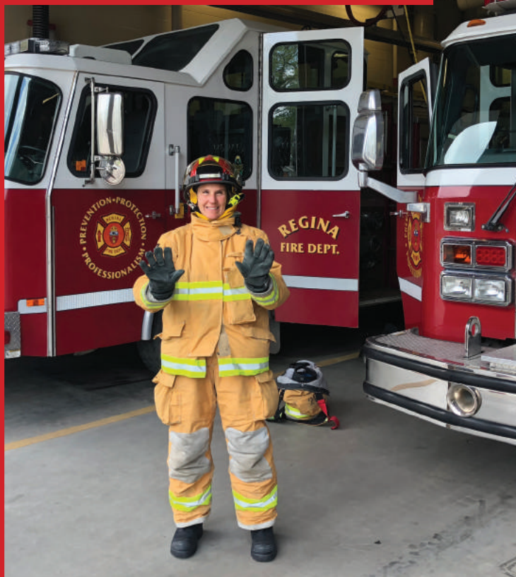
A helmet to protect her head and gloves on her hands.