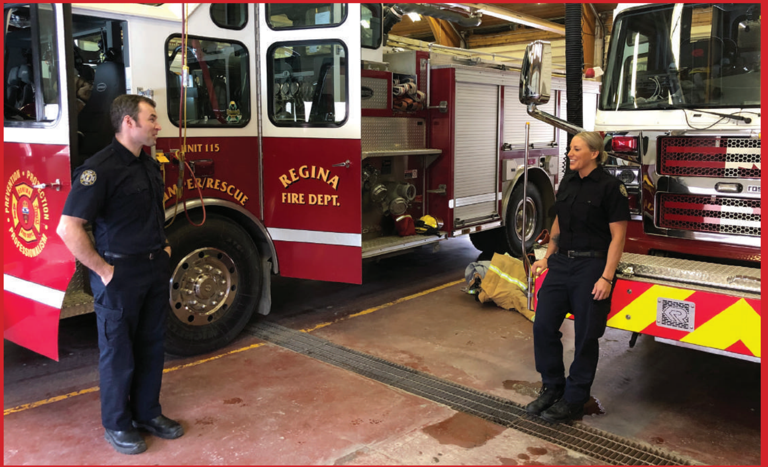
Firefighters are friends and helpers in Regina.