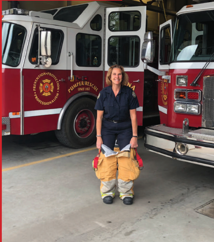
Firefighter pants and steel-toed boots.