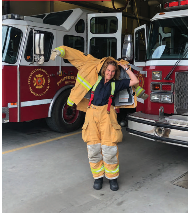
A Firefighter jacket.