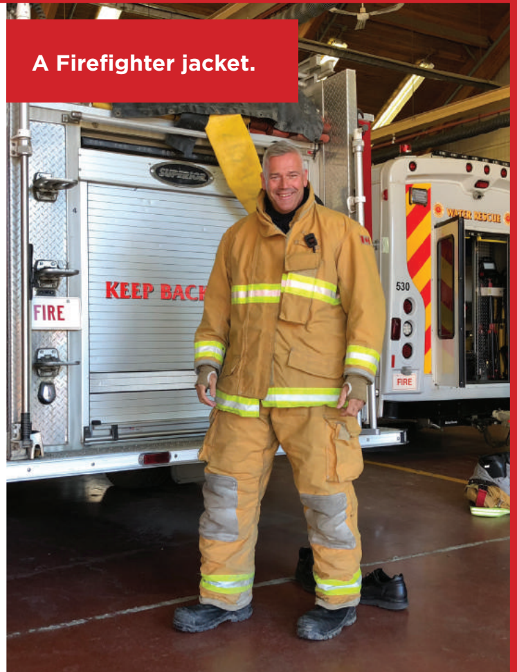
A Firefighter jacket.