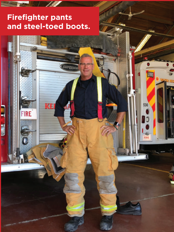
Firefighter pants and steel-toed boots.